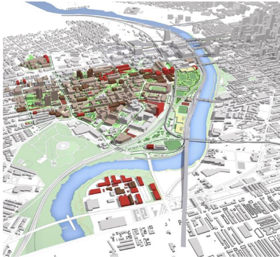
Penn Connects: Campus and Urban Connectivity