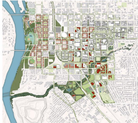
Campus Master Plan